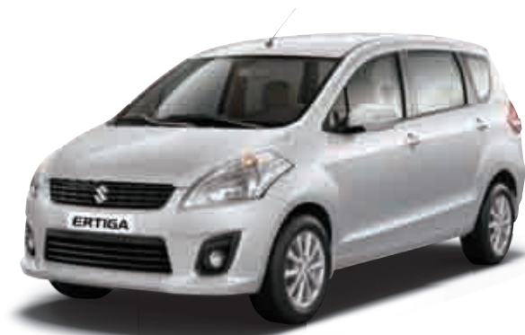
Superior White (26U)

Split folded 2 nd row seats + 3 rd row seats folded: 3/4 people + luggage space. Folding the 3 rd row seats and either of the 60:40 split 2 nd row seats expands carrying capacity and versatility even further, while still easily accommodating 3-4 adults in comfort.