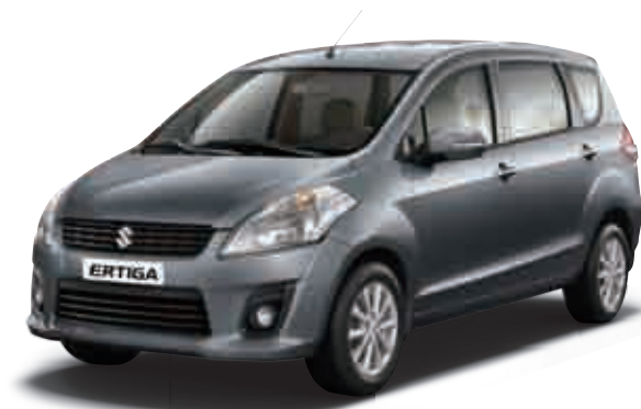
Granite Grey Metallic (ZTN)