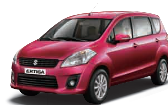
Firebrick Red Metallic (ZNW)