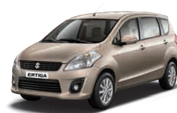
Ecru Beige Metallic (ZPY)