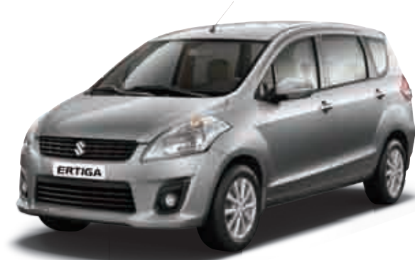
Silky Silver Metallic (Z2S)