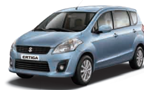
Serene Blue Metallic (ZTM)