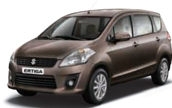
Dusky Brown Metallic (ZRB)